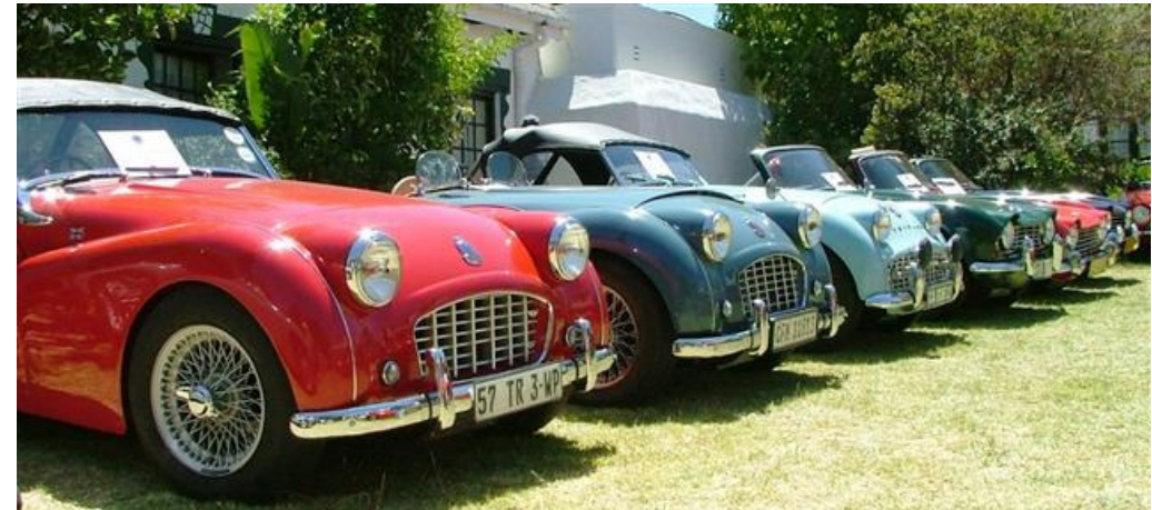
TR3, 3A, 4, 4A & 5's on show at Timour Hall 2009