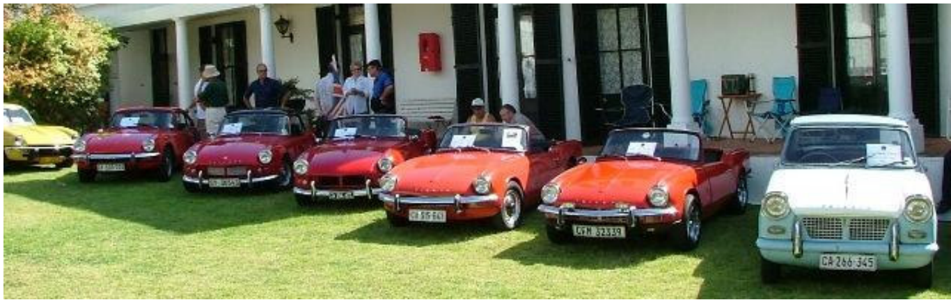
Spitfires and Herald on show at Timour Hall 2009

TSCC of SA, account number 078226929, Standard Bank Pinelands, branch code 036309.